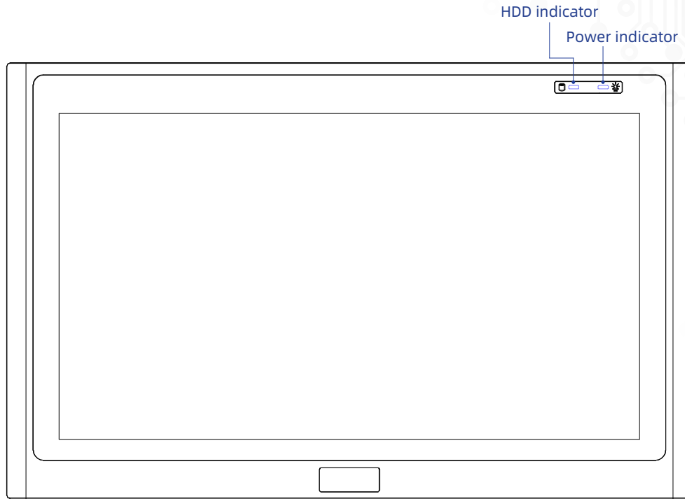
W15E-01 Panel button diagram

Note: The above structure diagram and interface configuration are for reference only. For more sizes and configurations, please consult with the sales.